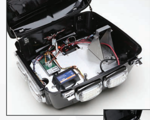
Touring box interior