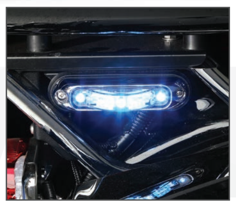
Surface Mount ION<sup>™</sup> Under Radio Box Mount Kit for use with one lighthead. Available in road side or curb side