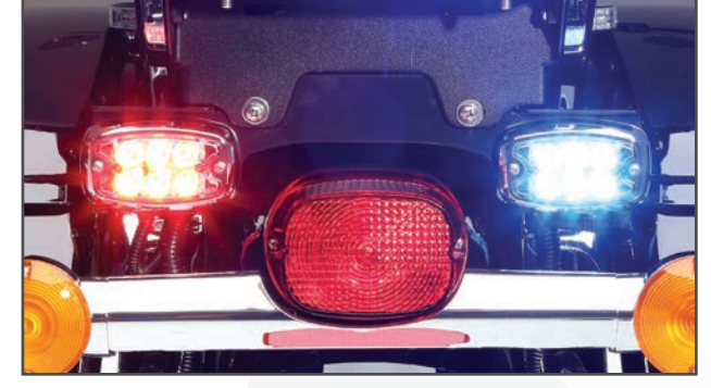
License Plate Bracket for horizontal mount of two lightheads M2KTHD1