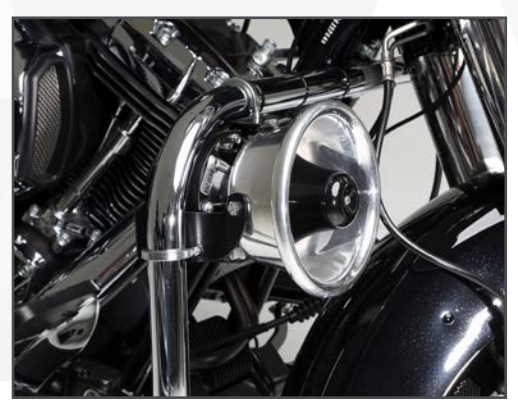
100 Watt Siren Speaker with polished aluminum flare and Speaker Mounting Bracket