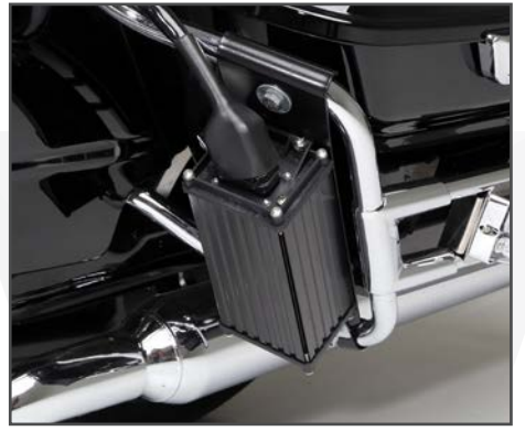
100 Watt Waterproof Siren Amplifier and Siren Mounting Bracket Kit