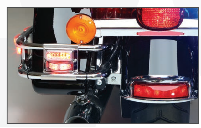
Rear (Harley-Davidson OEM Saddlebag) Crash Bar Mounting Kit allows for easy mounting of two lightheads. Includes flange RBKTHD9