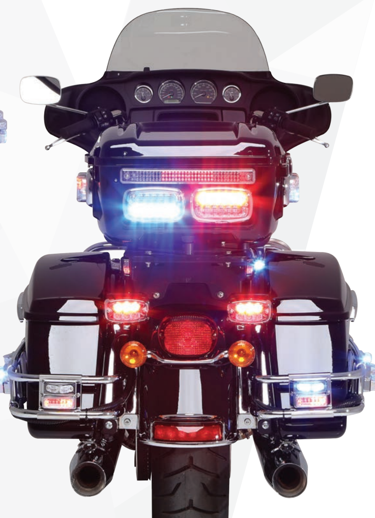
Harley-Davidson Electra Glide®