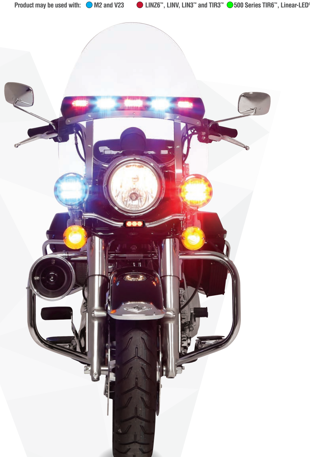
Harley-Davidson® Road King®