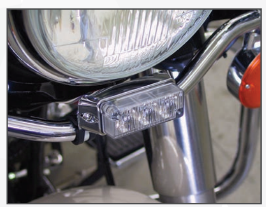
Under Headlight Mounting Bracket Kit holds one lighthead. Includes flange