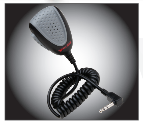
Noise Canceling Microphone W5MIC321